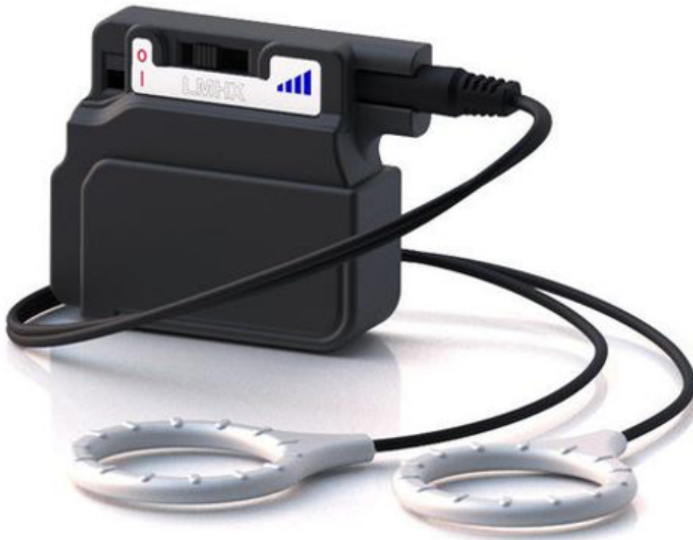
Figure 2. The ICES-PEMF system used most often with the cat during treatment was the Micro-Pulse Model A9 (the model C5 was also occasionally used). Each coil is nominally 40 mm in diameter. Also used was the model C5 (not shown), which is somewhat larger and has four output channels, but was delivering an equivalent pulse pattern with an identical electromagnetic waveform during treatment of the cat.