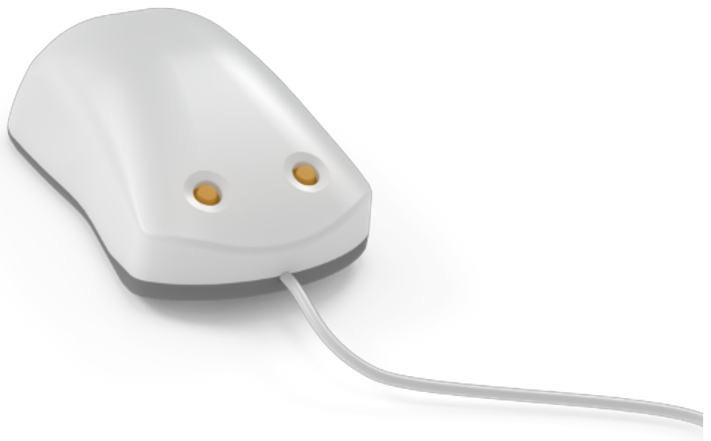
Figure 1. Two point vibro-tactile stimulator.

Somatosensory assessment was performed using a portable vibrotactile stimulation device (Brain Gauge, Cortical Metrics, Carrboro, NC). The device, of similar size and shape as a computer mouse, contains independent, computer-controlled probe tips which can deliver a wide range of sinusoidal vibrotactile stimuli of varying amplitudes and frequencies. All protocols used were originally conducted on a four-site mechanical stimulator (CM4; Cortical Metrics Model #4) which is functionally identical for 2 digits and was previously described in Holden et al. [3] and has been utilized to assess multiple sensory information processing characteristics in a number of subject populations [2,4,5,9,12-21]. Not only do these protocols demonstrate significant sensitivity to alterations in CNS processing, but they are independent of detection thresholds or skin sensitivity [20,22].